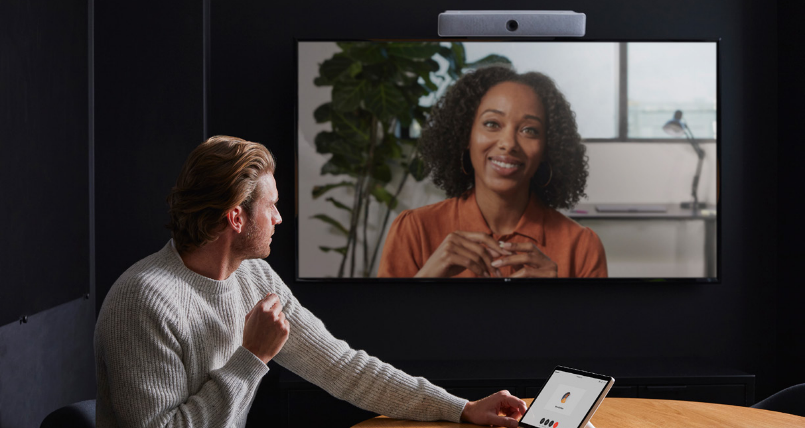
Above: Webex Room Kit in small room scenario

Webex Room Kit is a powerful collaboration solution that integrates with flat panel displays to bring more intelligence and usability to your small to medium-sized meeting rooms—whether registered on the premises or to Webex in the cloud.